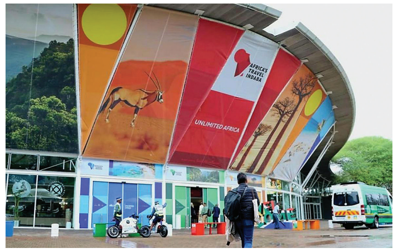
The 2026 Africa's Travel Indaba brings industry players together.