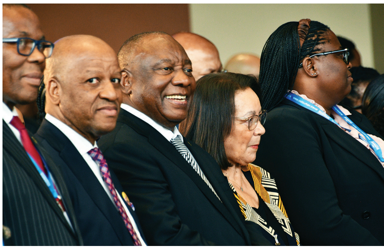
President Cyril Ramaphosa opened this year's Indaba.

"We take pride in the partnerships that have carried us through some of the most challenging years the global tourism industry has faced. It is the