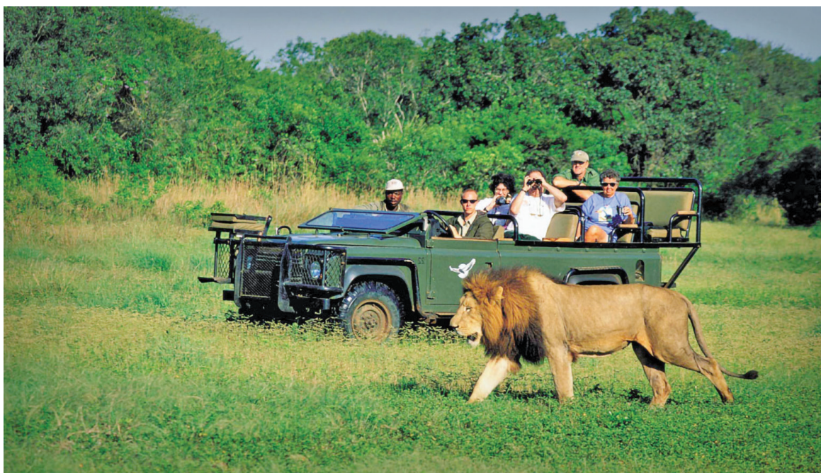
SANParks welcomed 6.8 million tourists at its sites in the past financial year.

tourism aspect that can showcase our continent, to show the beauty and the sophisticated cultures of our continent and the heritage, the very rich heritage, of this continent. We are the continent from which humanity originated. That's what we need to showcase," said Ramaphosa.